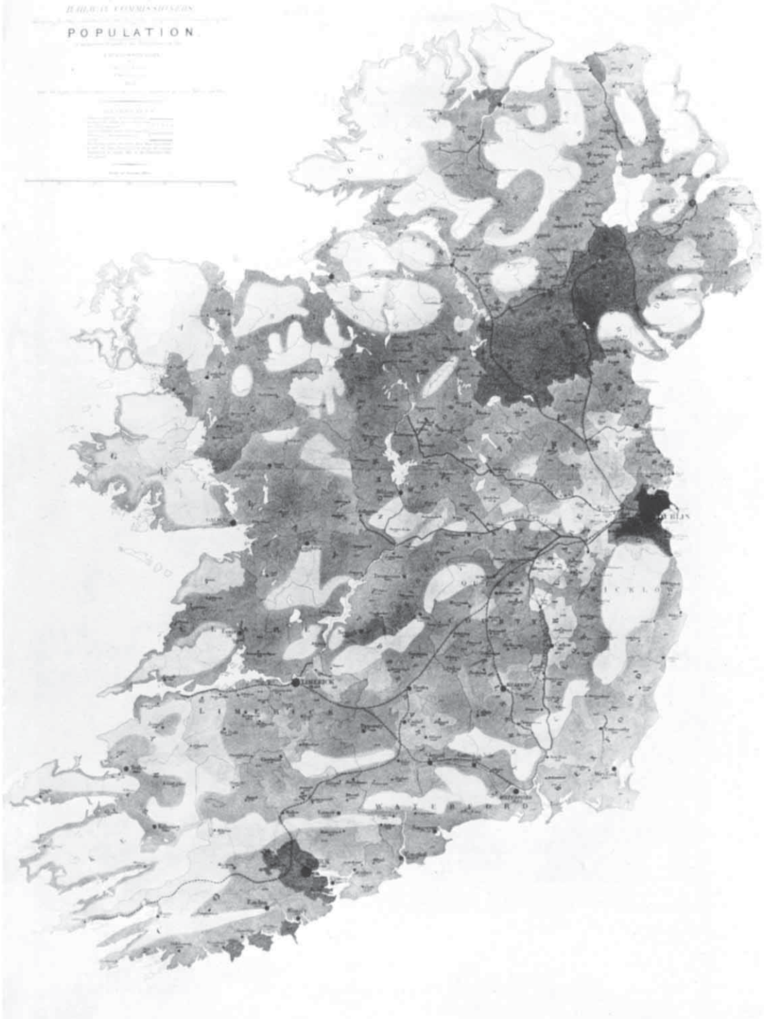
Harness' Population Map, 1837. Original, 1 inch to 10 miles. Brit. Mus.